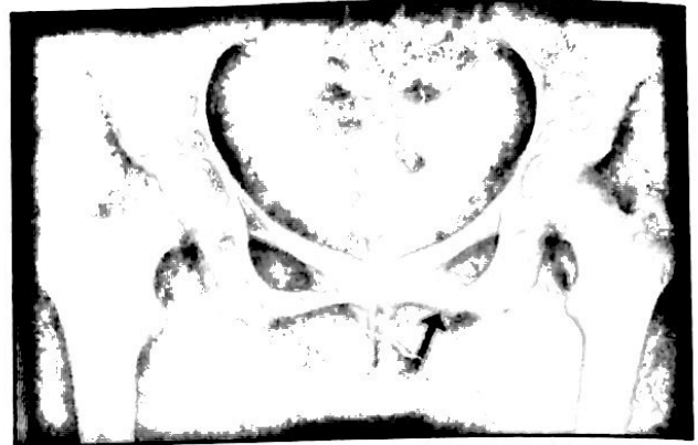
Fig. 4 Showing inferior ramus stress fracture.

Out of the 10 female officer cadets who presented with stress fractures, there were 8 stress fractures of pubic rami in 7 cadets. 5 had only inferior pubic rami fracture (left sided 3 and right sided 2). One had superior pubic ramus fracture of right side and