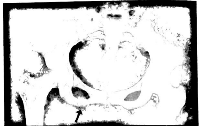
Fig. 5 Showing inferior ramus stress fracture.