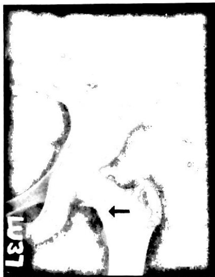
Fig. 3 Showing stress fracture of the femoral neck

Stress fractures of the pubic rami were diagnosed by finding tenderness over the inferior pubic rami and over the insertion of the adductor muscles along with a decreased range of abduction associated with pain. There was also pain on resisted adduction and external rotation of hip and an antalgic gait. Standard anteroposterior radiographs of the pelvis were taken and in one patient a MRI was performed to confirm the diagnosis when the initial radiographs were inconclusive. No bone scan was performed.