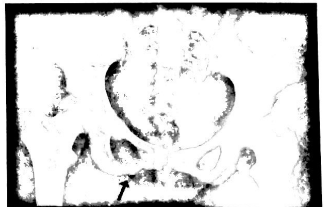
Fig. 6 Showing stress fractures of superior and inferior rami