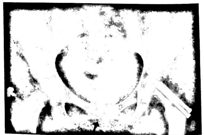
Fig. 7 Showing internal fixation of fracture of neck of femur