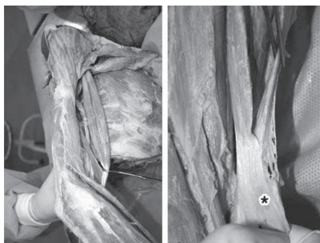
Forceps pointing at the belly of third head and *: bicipital aponeurosis.