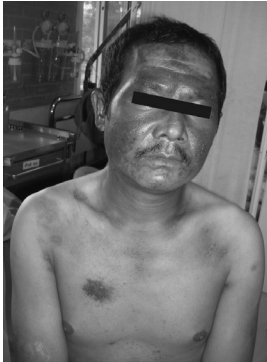
Figure 3. Facial erythema (erythroderma) in patients with dermatomyositis.