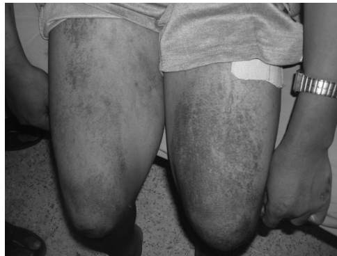
Figure 2. Gottron's sign(legs) in dermatomyositis.