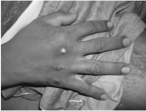
Figure 1. Gottron's sign in dermatomyositis.