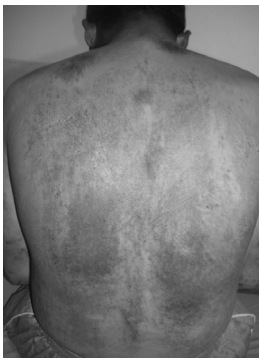
Figure 5. The shawl sign in dermatomyositis.

2:1. The peak incidence in adults occurs between the ages of 40 and 50, but individuals of any age may be affected. 15