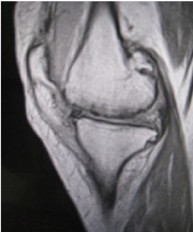
Figure 1. Absence of medial meniscus. There is hyperintense signal intensity on PD sagittal image in the area that was previously occupied by the medial meniscus. Associated articular cartilage loss seen in the femoral condyle with signal change in the subchondral marrow.