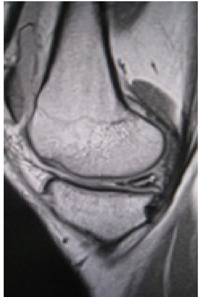
Figure 3. Sagittal PD image showing horizontal tear in the posterior horn of medial meniscus.

scan is routinely used to support the diagnosis for meniscal or cruciate ligament injuries prior to recommending arthroscopic examination and surgery. Identification of meniscal tears can be difficult to interpret and can be observer dependant as well as dependent upon the sensitivity of the scanner. Similar difficulties may exist in clinical examination as well. Our objective was to compare and correlate clinical, MRI, and arthroscopic findings in the diagnosis of meniscal and cruciate ligament injuries.