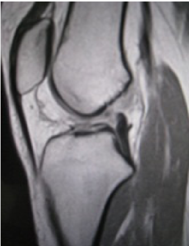
Figure 5. T2 sagittal image: Complete tear of ACL.

different types of meniscal tear (like bucket handle, flap, radial). The cruciate ligament was described as either well visualized, intact, not well visualized, or partial tear. MR examination of knee was performed before arthroscopy was done. The time interval between the performance of the scan and the arthroscopy was two months.