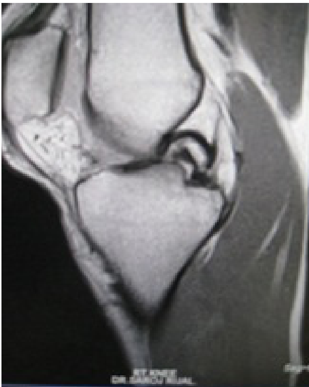
Figure 2. Double PCL sign in bucket handle medial meniscal tear.