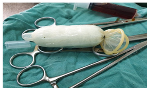
Figure 3. Condom covering foam piece rapped with gauze piece.