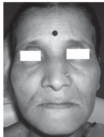
Fig 3: Three month follow up clinical photograph