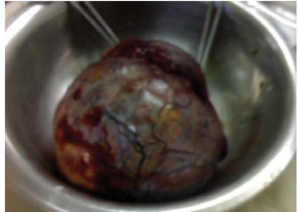
Fig 4: Testicular mass after excision