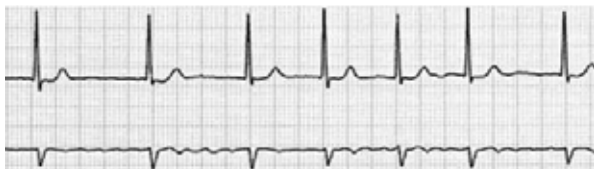
Fig 1: ECG tracing shows irregular ventricular rhythm associated with poorly defined atrial activity consistent with atrial fibrillation

to emergency department after three hours, he was fully conscious and stable. However he is a deaf and dumb person since birth. There was no history of any kind of cardiorespiratory disease. Vital signs taken at that time revealed pulse rate of 116 beats per minute, irregularly irregular with apex pulse deficit of 19 per minute, blood pressure 150/80 mmHg, respiratory rate 18/min and temperature 98.6° Fahrenheit. General survey of the whole body did not show any physical injuries and fixed entry and exit points. Systemic examination was unremarkable. Electrocardiogram taken at that time confirmed the diagnosis of atrial fibrillation (Figure 1). All the laboratory investigations including creatine phosphokinase (CPK) and cTroponin I (cTnI) were negative. There was no laboratory evidence of myoglobinuria. He was then admitted to Intensive Care Unit (ICU) for next 36 hours with continuous ECG monitoring. He was given oral Metoprolol 25 mg BID and Aspirin 75 mg OD. After 36 hours it reverted to sinus rhythm and was discharged without any medication (Fig 2).