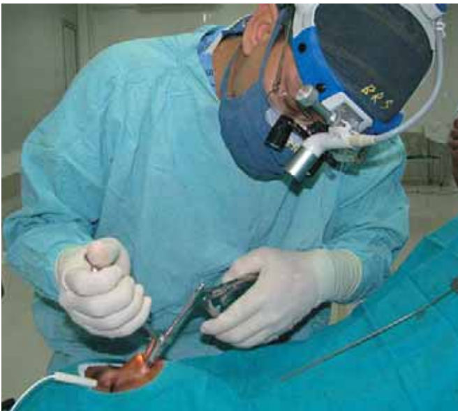
Fig 1: Transillumination of the lacrimal sac with insertion of a vitreoretinal light pipe.

Post operative complications were uncommon with two ENDCR patients with major nasal haemorrhage that required extended hospitalization. Four patients had wound infection and gaping requiring resuturing. The most common late complication was canalicular cut through by the silastic tube. This was observed in 24 (7.9%) of patients at the time of removal of the stent. Other complications were nasal mucosa synechial fibrosis 8 (2.6%), all of whom were ENDCR cases.