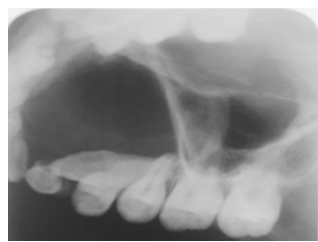
Figure 2. Occlusal radiograph showing the unilocular homogenous cystic radiolucency involving the maxillary right canine

and 7 of 14 DC (50%) showed root resorption. All the cases were associated with impacted teeth and 4 (28.57%) were associated with displaced teeth (table 2).