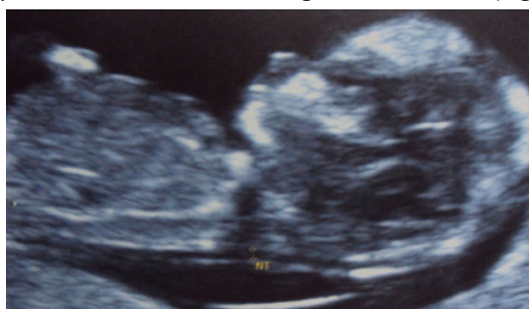
Figure 1. Nuchal Translucency (NT) Thickness Measurement Taken on Transabdominal Ultrasound.

Sonographic evaluation of fetal NT thickness was performed transabdominally using 3.5MHz convex transducer in Siemens acuson x-150 and x-300(CA 94093 USA) USG machine. The fetus which was in a good mid-sagittal section occupied at least 75% of the image on the screen. (Fig 1)