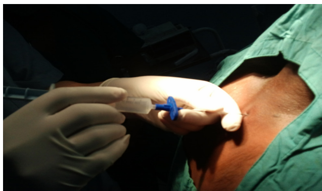
Figure 1. Technique of cervical epidural.

B (n=20) received 10 ml of 0.25% of bupivacaine +25µg of fentanyl and in group R (n=20) 10 ml of 0.375% of ropivacaine +25µg of fentanyl epidurally.