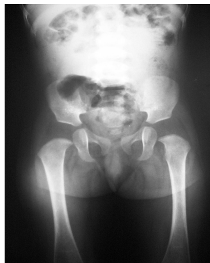
Figure 2. AP X-ray of both hips shows no abnormalities. The cartilage space and articular margins are intact.

Literature search revealed quite a few reports from the 1950s, indicating that primary tuberculous gluteal abscess can be syringe-transmitted. 5-7 Four cases occurred in a single hospital where a nurse had developed pulmonary tuberculosis and had given multiple muscular injections to the affected children. 5,6 Debré et al reported an epidemic in a nursery in 1951. A needle and a syringe were contaminated with Mycobacterium tuberculosis from a child with a tuberculous gluteal abscess who had been given an injection of penicillin, and the same syringe was used on other infants. 5,7 However, during that era, reuse after sterilization of needles and syringes was the norm, and deficiency in sterilization might explain the cause of these infections. No such cause could be identified in our patient. Non-tubercular cold abscess of the thigh following intramuscular injection and non-tubercular cold abscess of psoas muscle have previously been reported. 8,9 Another differential diagnosis can be tuberculous myositis, but the lesion was in the subcutaneous tissue, superficial to the muscle plane. 5 Primary tuberculous gluteal abscess, without bone involvement, has recently been reported in infancy and is a distinct possibility in this child.