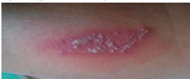
Figure 8: Typical lesion on 7 th day after contact