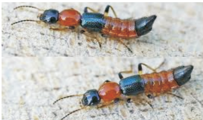
Figure 1: Pederus insects

Paederus dermatitis is an irritant contact dermatitis caused by the release of vesicant toxin named 'pederin' contained in the hemolymph of 'paederus' insect (Figure 1), mainly by crushing the insect onto the skin 1 . The primary lesion is vesicle/bulla over an erythematous base that may suppurate to form pustules. Students in the UCMS hostel are commonly affected by this dermatitis. We report a case of Paederus dermatitis that was self reproduced on the skin.