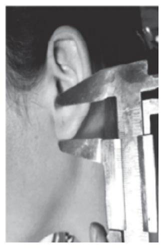
Figure 3. Measuring height of auricle