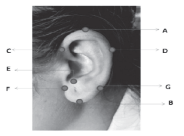
Figure 2. Point from which various measurements were taken

Auricle height (AH) from point A-B Auricle width (AW) from point C-D Lobular height (LH) from point E-B Lobular width (LW) from point F-G