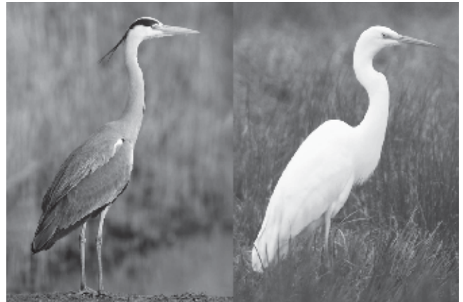
Fig 2. a) Herons and b) Egret birds 7

Natural infections of Japanese encephalitis (JE) occur in Adreid birds (herons and egrets). Virus spreads from bird to bird through Culex tritaeniorhyncus mosquito. Culex vishnui , Culex gelidus , Culex whitmorei , Culex epidesmus act as next common vectors in India. Human infection occurs from these reservoir birds by several species of Culicine mosquitoes. JE virus cannot transmit from one person to another. JEV infection is more common in children below 15 years. Most adults in endemic countries have natural immunity after childhood infection, but persons of any age may be affected. In South-East Asia JEV transmission intensifies during the rainy season, during which mosquito population increases. 7