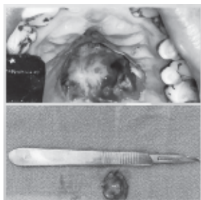
Figure 4. Clinical photograph showing wide local excision of lesion

The given H and E stained section showed encapsulated tumor containing both epithelial and mesenchymal component. At 10x magnification shows epithelial cells present in the form of sheets and strands and arranged in ductal and tubular pattern. There is presence of plasmacytoid cells which are round to polygonal cells having eccentric nuclei and eosinophilic cytoplasm. Plasmacytoid cells are surrounding duct like spaces filled with eosinophilic coagulum in few areas. There is presence of fibromyxoid stroma with areas of hyalinization and squamous metaplasia along with keratin formation. There is also presence of chondroid areas and salivary gland. Areas of hemorrhage and fat cells are also seen. At 40x magnification showed stellate cells with cytoplasmic processes and it also confirms the features seen in the low power view.