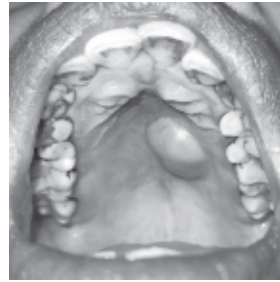
Figure 1. Clinical photograph showing well defined mass over left palate on computed tomography (CT) scan, there was no obvious bony erosion.

A 34 year female patient was presented to Department of Oral and Maxillofacial Surgery in Universal College of Medical Sciences, complaining of swelling on left posterior palatal region since 1.5 month. Patient was apparently well 1.5 months back when she noticed swelling at left posterior palate. Initially swelling was small in size of approx. maize grain then it gradually increased to 3cm × 2cm of present size. It was oval in shape, sessile, smooth mass with well defined margin, non-fluctuant and non-tender on palpation.