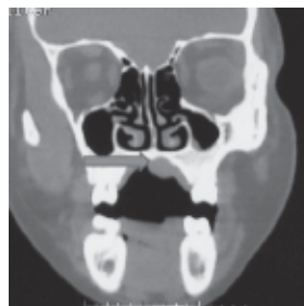
Figure 2. Coronal view of computed tomography scan showing soft tissue mass on left palate with no bony erosion

In FNAC, well fixed Giemsa stained cellular smears showed variable sized clusters of benign myoepithelial cells arranged in loose cohesive clusters and few scattered singly embedded in myxoid stroma. Individual myoepithelial cells are round to oval, few show mild anisonucleosis with dense nuclear chromatin and moderate to abundant amount of cytoplasm. Many myoepithelial cells are plasmacytoid in appearance. Also seen are benign ductal epithelial cells scattered singly. Individual ductal epithelial cells are round to oval with dense nuclear chromatin and moderate amount of cytoplasm. All these features suggestive of benign salivary gland neoplasm.