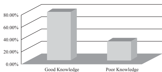
Figure 3. Level of knowledge of dental interns

In a questionnaire survey of dental interns, 75% had good knowledge of radiation, and 25% had poor knowledge of radiation as shown in figure 3.