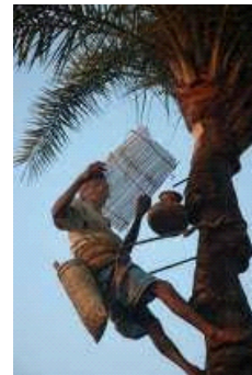
Fig 2. A date palm sap (Toddy) collector uses a bamboo skirt to cover an area of shaved bark on the tree and protect the sap from fruit bats; a method of making date palm sap safer to drink. 37

Health care workers caring for suspected NiV patients, or handling specimens from them, should implement standard infection control precautions at all times, such as regular hand washing and disinfecting with 70% ethanol is very important to avoid the risk of human-to-human transmission. Health care workers should employ quarantine methods and use barrier methods such as gloves, masks, and disposable gowns, as they are at high risk of human-to-human transmission. 28,33 NiV is easily inactivated by soaps, detergents and many disinfectants. 38