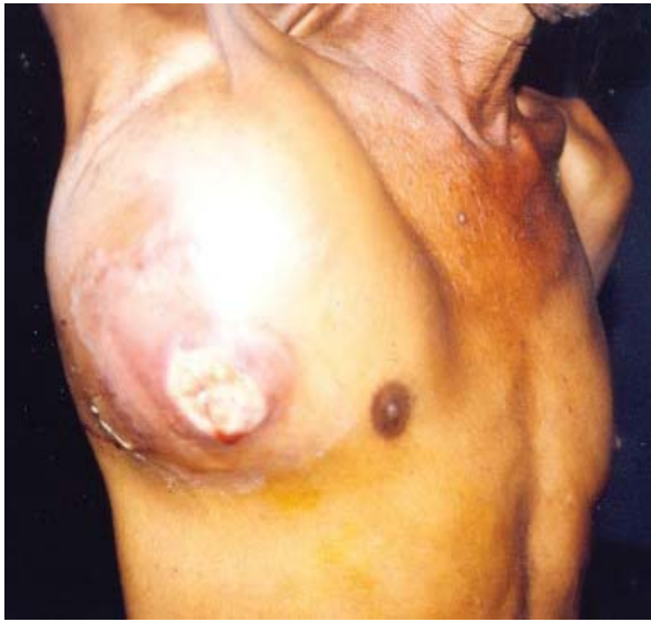
Figure 1. Ulcerated lump involving right breast and axilla