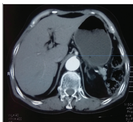
Abdominal CT scan showing compression at the level of origin of celiac artery

A 75 year old lady presented in our OPD with complaints of pain in the epigastric region for past 6 months which was aggravated by taking meals. She also gave history of weight loss and loss of appetite for past 3 months. Her physical examination was unremarkable. All the lab reports were within normal limits. She had been initially overlooked as a case of acid peptic disease. After her symptoms persisted she had undergone upper endoscopy and abdominal ultrasound, both of which were normal. Finally, a decision to perform a CECT abdomen and pelvis was made which revealed median arcuate ligament of the diaphragm impinging on celiac trunk immediately after its origin.