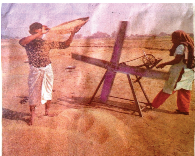
Figure 1: Winnowing machines commonly used in villages

Nepal is an agriculture based economy and farming methods are still primitive. Winnowing machines made by local blacksmith are being used commonly these days. These machines are used to separate grain from chaff during harvesting season by wind current created due to running fan. (Figure 1) As farmers have to spend much of their time around these indigenous machines, they are at risk of being injured by them.