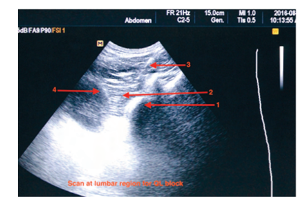
Figure 2: Ultrasound image of needle insertion for Quadratus lumborum catheter placement

Direction of the needle 2. Spinous process 3. Left Kidney 4. Renal vessels