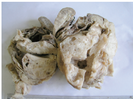
Figure 1: Gross appearance, Immature teratoma kidney. Solid and cystic areas are shown. Normal kidney is evident in the upper region.