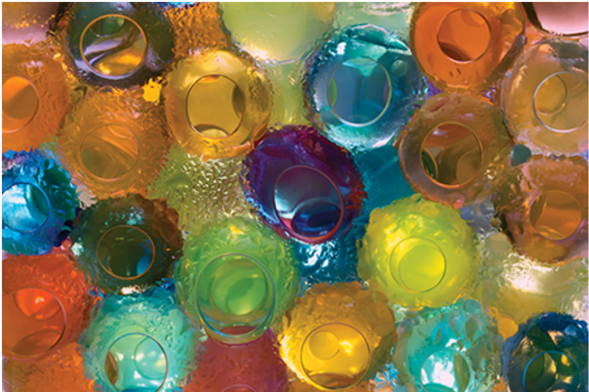
Figure 3. Water-absorbing gel beads look like candy so children may be tempted to swallow them. 18