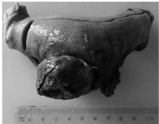
Figure 1. Cut surface of surgical specimen showing jejunal diverticulum with pinhole perforation

The elderly woman in our case with rare disease of jejunum-ileal diverticula presented with acute perforation peritonitis and was successfully managed with resection anastomosis during emergency laparotomy.