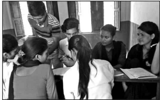
Students participating in cooperative storytelling activity