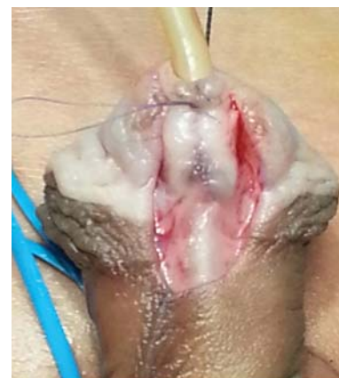
Fig 3: Neourethra (tubularization)