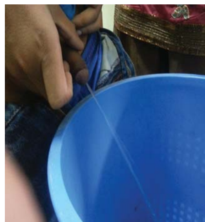
Fig 6: Straight urinary stream