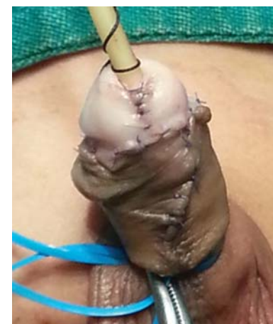
Fig 5: Final repair