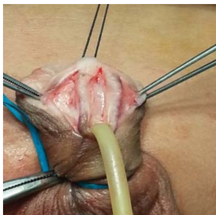
Fig 2: Midline and parallel plate incision