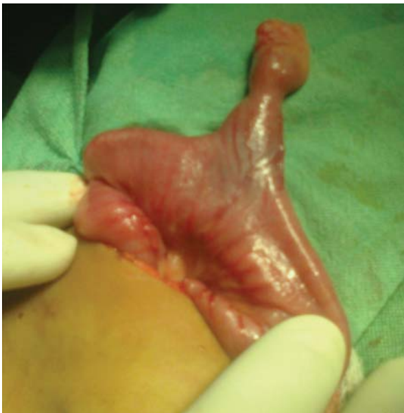
Fig 2: Intraoperative photograph of Meckel's Diverticulum

Baby was explored in emergency operation theatre. A 3.5cm long Meckel's diverticulum was found just 32 cm from ileocecal valve. The diverticulum was broad based. Resection of the ileum was done 5cm proximal and 4cm distal to the diverticulum (Figure 2). The specimen was opened along the antimesenteric boarder which revealed multiple ileal ulcers (Figure 3). Anastomosis was done between the two ends of ileum. Baby did well postoperatively. Histopathology revealed ectopic gastric mucosa in the diverticulum and multiple peptic ulcers in the resected specimen.