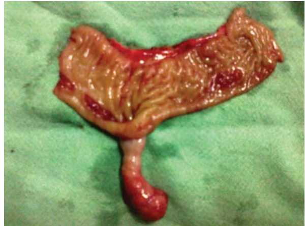
Fig 3: Ileal lumen containing Multiple ileal ulcers.

Baby was explored in emergency operation theatre. A 3.5cm long Meckel's diverticulum was found just 32 cm from ileocecal valve. The diverticulum was broad based. Resection of the ileum was done 5cm proximal and 4cm distal to the diverticulum (Figure 2). The specimen was opened along the antimesenteric boarder which revealed multiple ileal ulcers (Figure 3). Anastomosis was done between the two ends of ileum. Baby did well postoperatively. Histopathology revealed ectopic gastric mucosa in the diverticulum and multiple peptic ulcers in the resected specimen.