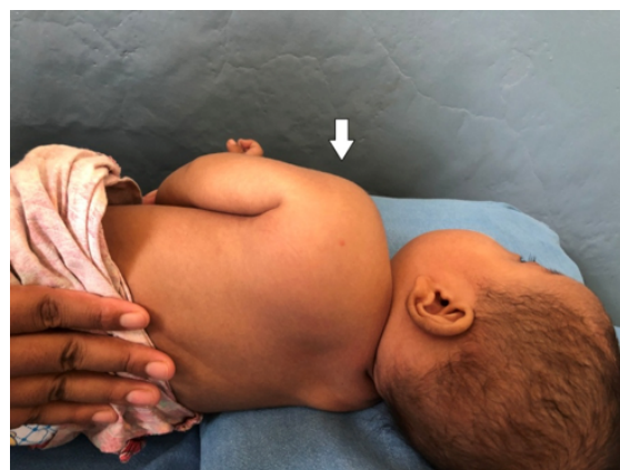
Figure 1. Two months - old male infant with swelling of left shoulder