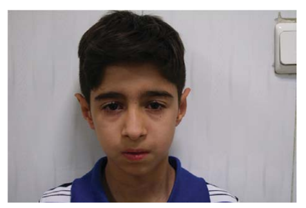
Fig 1: Showing facies of the patient (craniofacial anomalia) permission taken

as malabsorption of fats and disruptions of glucagon secretion and its response to hypoglycemia caused by insulin activity are major concerns when JBS is diagnosed<sup>1,3,8</sup>. Pancreatic exocrine insufficiency in JBS can additionally stem from congenital replacement of the acini with fatty tissue<sup>1,3,8,9</sup>. Near total replacement of the entire pancreas with fatty tissue has also been reported. This is a progressive, sometimes fatal consequence of the disorder<sup>9</sup>.