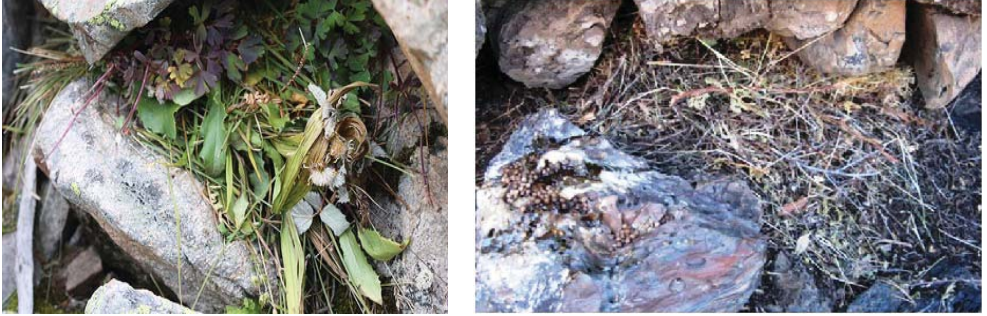
FIG. 2. Fresh hay-pile in summer/ rainy and dry hay pile in winter in LNP.

not active in storing hay-pile. Only seven hay-piles were observed during winter season with dry vegetation of Juncus thomosnii , Fragaria species, Argemone species, Ligularia amplexicaulis , Artimisia vulgare , Poa species, Rumex nepalensis , Graminae species, and some very dry plant species that were unidentified (Fig 2).