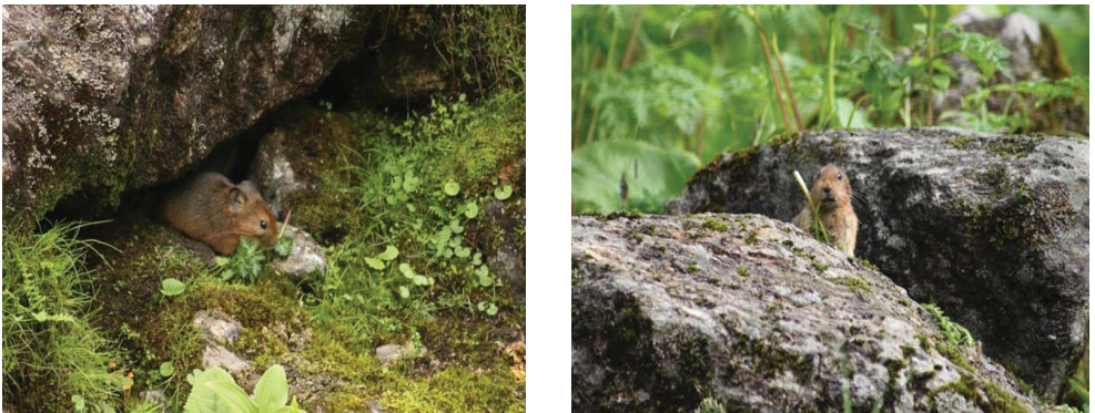
FIG. 3. Pika carrying plants to construct hay-pile for winter storage.

Only Royle's pika ( Ochotona roylei ) was found at forest and its edge area and they were never observed carrying forage for winter hay-pile in any season. The transferring foods by pikas in Langtang were not observed above 3900 masl too. In rainy and summer season behaviour of transferring food were observed only for 12 times in 449 hour observation (fig. 3). They were recorded three times in Thadepati, six times in Phedi, one in Laurebina area and two in Langtang valley. All these area were in subalpine area with broken rocks above 3500 masl and below 3900 masl. Among these observations only two incidents were belonged to O. macrotis in Phedi.