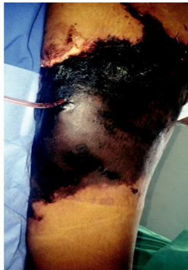
Figure 1: Necrosed skin several days after degloving

Eighteen year old girl was run over by a car. She had degloving of whole circumference of the upper half of right thigh. She was initially managed in a private hospital outside Kathmandu. The wound was irrigated and flap was sutured in place before sending the patient to Kirtipur Hospital. When she came to us, the skin flap was already black and necrosed (Figure 1). It was excised completely. Wound was dressed daily for few days. Split skin graft was applied to cover the wound afterwards. She got discharged from the hospital in three weeks time after full recovery.