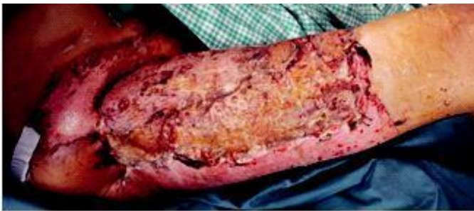
Figure 3: Grafted area after two weeks