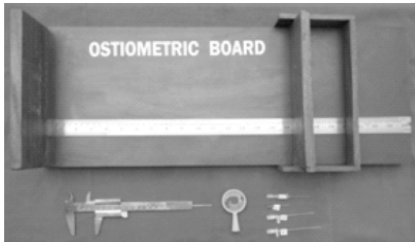
Figure 1: Instruments used in the study

Each femur was numbered serially with numbering sticker to help in identification. Their side (left or right) was determined. The diaphyseal nutrient foramina were observed in all the bones with a hand-lens. Various parameters were recorded for each of the femur. Total length and distance of nutrient foramen from upper end were measured in centimeters. Locations of nutrient foramen and number of foramen were also noted in relations to surfaces. The sizes of nutrient foramen were measured with the help of hypodermic needles of 18G to 24G.