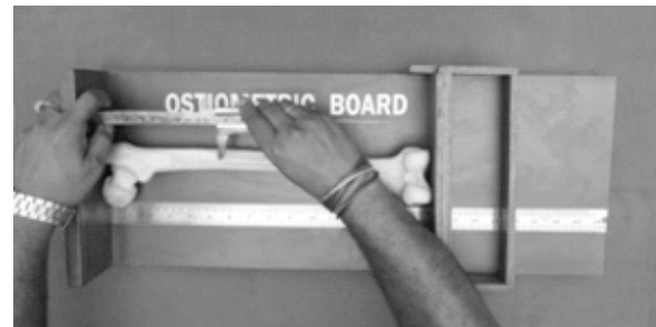
Figure 4: Measuring the distance of nutrient foramen from upper end

The distance of the nutrient foramen from the upper end of the bone was measured with the help of sliding vernier caliper and recorded. The range and the mean distance of nutrient foramen from upper end was calculated and recorded (Figure 4).