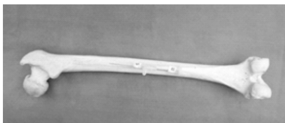
Figure 5: Measuring the caliber of nutrient foramen

Hypodermic needles of gauge 18 to gauge 24 were used to measure the caliber of the foramen. If the needle of 18G size passed through the nutrient foramen satisfactorily, it was classified as 'large' sized. If the needle of 24G size passed through the foramen, it was classified as 'small' size. If the needle of the 20G to 22G size passes through the nutrient foramen it was classified as 'medium' sized. Both large and medium-sized foramen was also categorized as being 'dominant'. If the needle of 24G size could pass or could not pass through the foramen it was classified as 'small' sized or 'accessory' nutrient foramen.