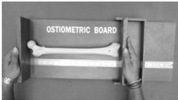
Figure 2: Measuring the length of femur

The total length of each femur was measured with the help of osteometric board (Figure 2) and total length was recorded in centimeters. Determination of the total length of the individual bones was done by taking the measurement between the superior aspect of the head of the femur and the most distal aspect of the medial condyle. After measuring all the bones the 'range of total length' and the 'mean of total length' for femur was obtained.