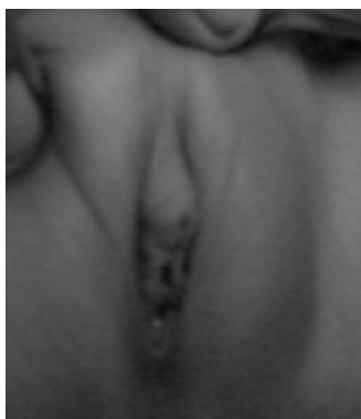
Figure 4: Follow up after 3 months

Labial agglutination should not be confused with labial fusion which is due to intra uterine, congenital or chronic, post nasal inflammation of vulva. In case of fusion simple incision has to be given but one should not confuse it with the virilised external genitalia. The gynecologist should be aware of the situation that labial agglutination is a self limiting condition which usually disappears at puberty when estrogen level in the blood rise. Agglutination encourages pocketing of urine irritation and infection. Labial adhesion may be treated as follows. Lubricated probe is inserted into the anterior opening through which the child passes urine and a quick firm pressure anteriorly readily separates the labia. Estrogen cream or petroleum jelly may be applied which would cornify the epithelium 4 . Repeated separation of labia may be required.