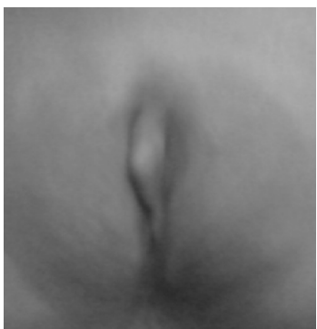
Figure 1: Showing typical labial adhesion with mid line raphe