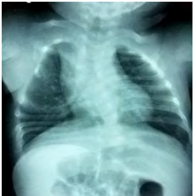
Figure 2: Chest radiology showing deformation at the second, fourth, and fifth rib and the scoliosis.