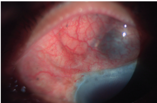
Figure 2: Diffuse illumination slit lamp photograph showing the PCIOL in subconjunctival space