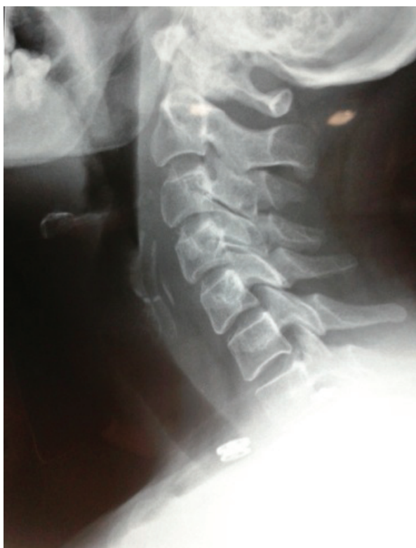
Figure 3: X ray neck showing foreign body in esophagus