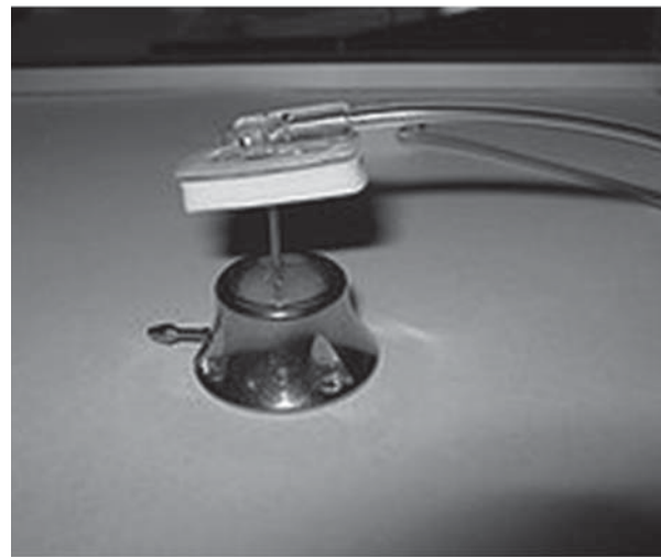
Figure 4: Titanium chemoport