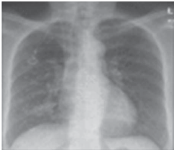
Figure 3: Postprocedural chest X-ray