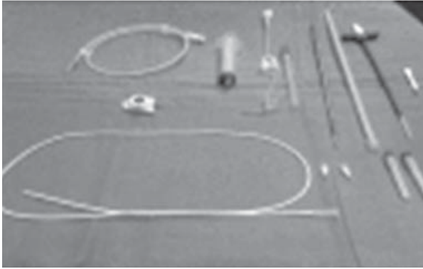
Figure 1: Components of Subcutaneous Venous Access Device