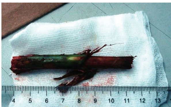
Figure 2: Wooden foreign body removed from the orbit

was unremarkable. The pupillary reaction and fundus examination were normal. The patient was managed with intravenous antibiotics and topical antibiotic steroid drops. The patient was monitored in the eye ward for signs of infections and surgical complications. On the third post-operative day the drain was removed as there was minimal serosanguinous discharge. The lid swelling was gradually decreasing and the wound site remained healthy. On the tenth postoperative day the patient was discharged from the eye ward on oral antibiotics. At the time the lid swelling had subsided but there was complete ptosis. The scar was healthy. The extraocular motility was still restricted but the visual acuity had improved to 6/18.