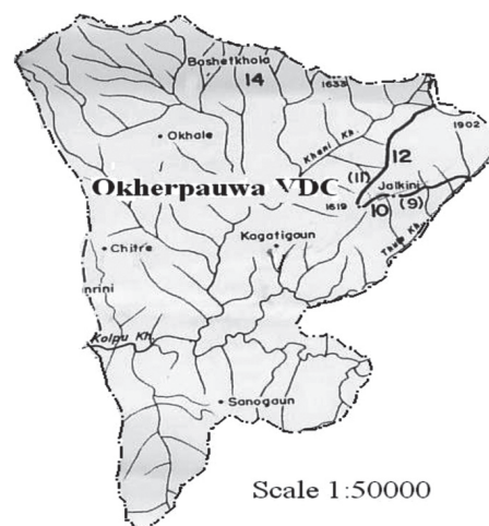
Fig. 3. Map of Okherpauwa VDC

To undertake this research, ethnomedicinal data as primary data were collected from the study area through observation, participation and interviews. A standard set of questionnaires were used in order to obtain the detail information about the medicinal plants and animals. Informal interviews were taken with reliable persons and the local people such as old persons and traditional faith healers. Photo collection was made. Four major field visits of five days each during 2007 and 2008 and many informal field visits were made there after. Random sampling techniques were employed to recruit 29 interview subjects. The actual condition of ethnobiology and indigenous knowledge about medicinal animals and plants were observed directly and recorded from the key informants and faith healers. The plant specimens were collected and identified on the spot with the help of the local people and some were identified with the help of botanists and zoologists from the Central Department of Zoology and Botany (T.U.) respectively and the National