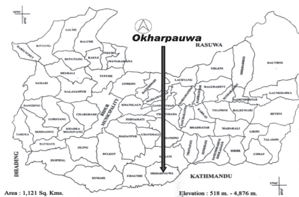
Fig. 2. Map of Nuwakot District

Okherpauwa supports subtropical vegetation consisting of Schima wallichii (chilaune) and Castanopsis indica (Katus). The middle slopes of the mountains have Pinus roxburghii (Sallo), Quercus lanata (Banjha) and Rhododendron spp (Laligurus). Alnus nepalensis (Uttis) occupies almost all wet ravines and gullies. Eupatorium sp. (Banmara) occurs extensively in degraded forest and scrubland. Some trees of Toona ciliata (Tuni), Dalbergia sisso (Sisau), Albizia lebbek (sirisi) are also found. Among mammalian fauna Canis aureus (Jackal), Panthera pardus (Chituwa), Macaca mulata (Bandar) etc., are found.