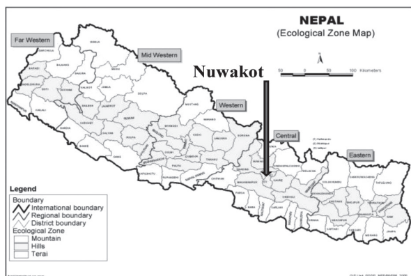
Fig. 1: Map of Nepal

To undertake this research, ethnomedicinal data as primary data were collected from the study area through observation, participation and interviews. A standard set of questionnaires were used in order to obtain the detail information about the medicinal plants and animals. Informal interviews were taken with reliable persons and the local people such as old persons and traditional faith healers. Photo collection was made. Four major field visits of five days each during 2007 and 2008 and many informal field visits were made there after. Random sampling techniques were employed to recruit 29 interview subjects. The actual condition of ethnobiology and indigenous knowledge about medicinal animals and plants were observed directly and recorded from the key informants and faith healers. The plant specimens were collected and identified on the spot with the help of the local people and some were identified with the help of botanists and zoologists from the Central Department of Zoology and Botany (T.U.) respectively and the National