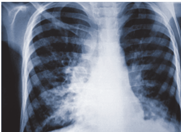
Chest X-ray showing bilateral bronchiectatic changes in both lower lung fields.

The child was admitted with the provisional diagnosis of pneumonia with distress in a child with HIV infection. Investigations revealed white blood cell count of 4180 cells/mm 3 with 42% neutrophils, 47% lymphocytes, 10% monocytes and 1% eosinophils. Hemoglobin was 10.3 gm% and platelet count was 106,000 cells/mm 3 . The erythrocyte sedimentation rate was 57 in the 1st hour. CD4+T cell count was 511 cells/uL and constituted 13% of the lymphocytes. There was no CD4+T cell count done previously. Three samples of gastric aspirate for tuberculosis was negative, gram stain showed gram positive cocci in pairs and chain but culture was negative. Mantoux test was negative. Chest radiography was suggestive of bilateral bronchiectatic changes and high resolution CT scan confirmed bilateral bronchiectasis.