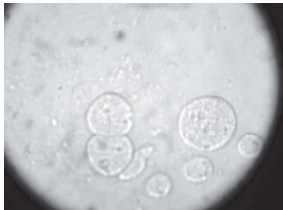
Fig. 1: Amoeboid form of Naegleria fowleri undergoing binary fission (arrow).