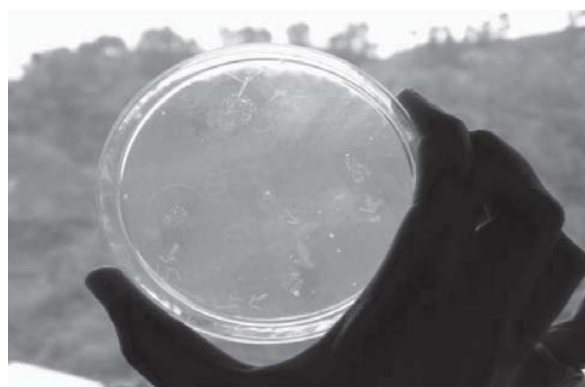
Fig. 3: Culture on 1.5% non nutrient agar showing areas of clearing.