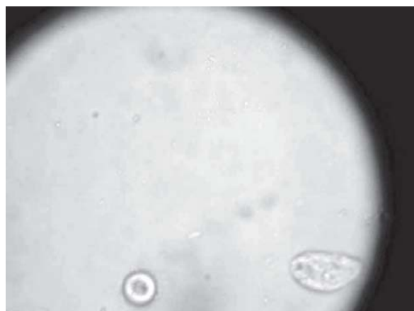
Fig. 2: Flagellate form of Naegleria fowleri .