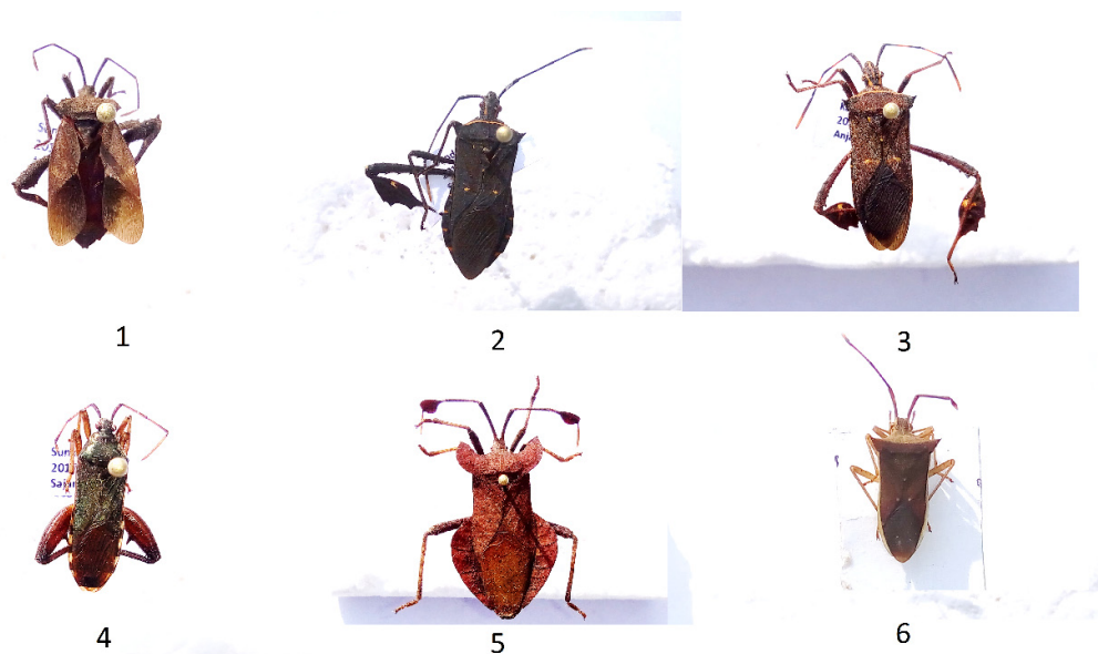
Fig: 1. Acanthocoris scabrator 2. Leptoglossus gonagra 3. Leptoglossus gonagra 4. Cloresmus khasianus 5. Dalader acuticosta 6. Cletus bipunctatus