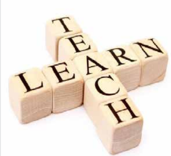
Fig 2: To teach is to learn twice

The art of the teaching is the art of assisting discovery. Professors known as outstanding teachers do two things; they use a simple plan and many examples.