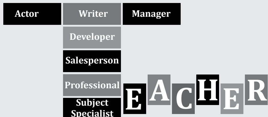
Fig 1: A great teacher

Teaching is an art, to be perfected. Teaching is not a lost art, but the regard for it is a lost tradition.