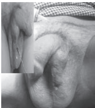
Figure1: Perineal examination showing giant calculus, suprapubic cystostomy and fistula tract with pus.