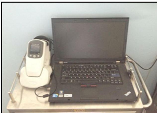
Figure 4. Clinical spectrophotometer.

Clinical spectrophotometer (Crystaleye, Olympus, Japan) (Figure 4) was used to analyze the color of