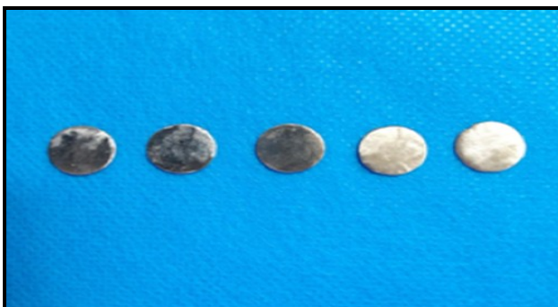
Figure 2. Finished metal discs with thickness of 0.4.

After all 20 metal disc (Figure 2) were prepared, they were randomly divided into 4 groups (A, B, C and D) each having five samples. Shade A2 of commercially used low fusing ceramic was selected