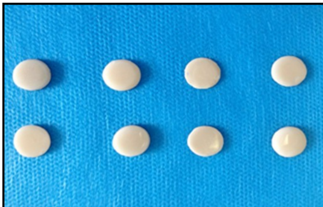
Figure 3. Finished metal ceramic tabs.

After dentin body, the specimen were flattened and smoothed using a different grit of water sand paper. Overall thickness of the specimen was maintained to group A 1.2mm, group B to 1.7mm, group C to 2.2mm and the group D to 2.7mm. Finally all the specimen were glazed and made ready for spectrophotometric analysis (Figure 3).