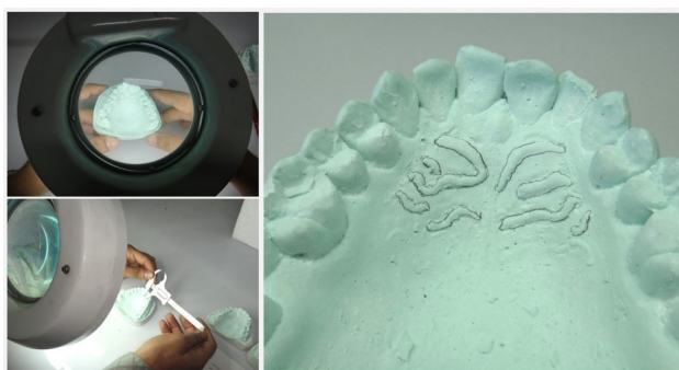
Figure 1: Tracing of palatal rugae

Palatal rugae refers to the ridges on anterior part of palatal mucosa on each side of median palatine raphe. 16 The study of rugae is one of the important tools in identification especially of edentulous individuals when ante- mortem and post-mortem dental records are present. 12 The number of rugae has been found to be unchanged up to the age of