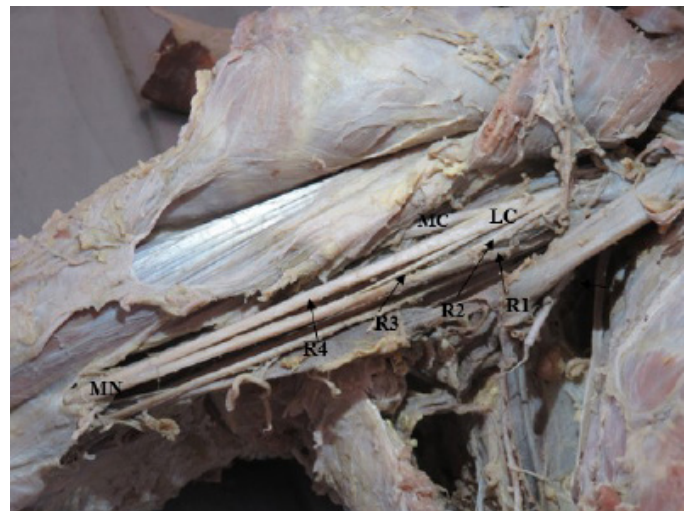
Figure 2: Median nerve with four roots.

Note: R1- Medial root; R2 – additional root; R3 – lateral root; LC – lateral cord; MC – Medial cord; MCN – Musculocutaneous nerve; MN – Median nerve.