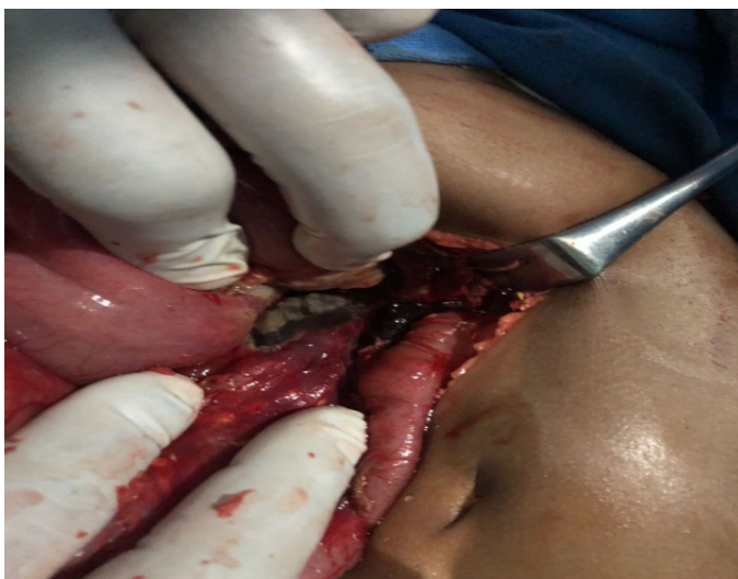
Figure 2: Necrotizing mass between transverse colon and stomach

Gall bladder and CBD were free of worms but few worms were noticed in the proximal jejunum that were milked into the large intestine. Upon entering the lesser sac, a necrotic mass of 4x4cm was seen along the stomach bed ensuring a mass effect on the stomach & transverse colon (Figure 2). The mass was arising from the tail of pancreas. The Necrosectomy was done and drains were placed in the lesser sac, retroperitoneal space and in the pelvis after thorough peritoneal lavage.